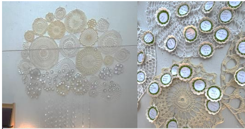
A unique way of celebrating baptisms in the congregation!