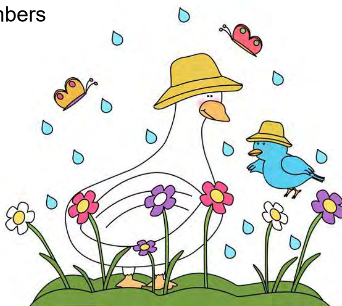
Cover Photograph: Edinburgh in Spring time Pinterest