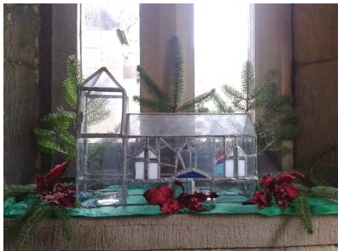
The porch is given a festive makeover