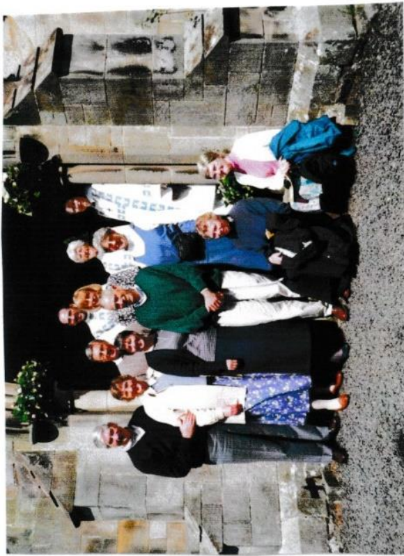
VISIT BY "LOST SOULS" IN 2000.