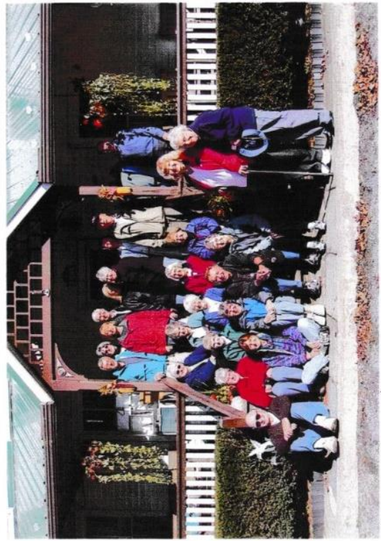
"LOST SOULS" IN PENNSYLVANIA 2011