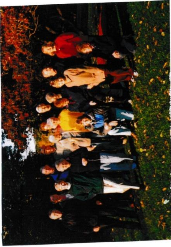
"LOST SOULS" IN WEST VIRGINIA 2006