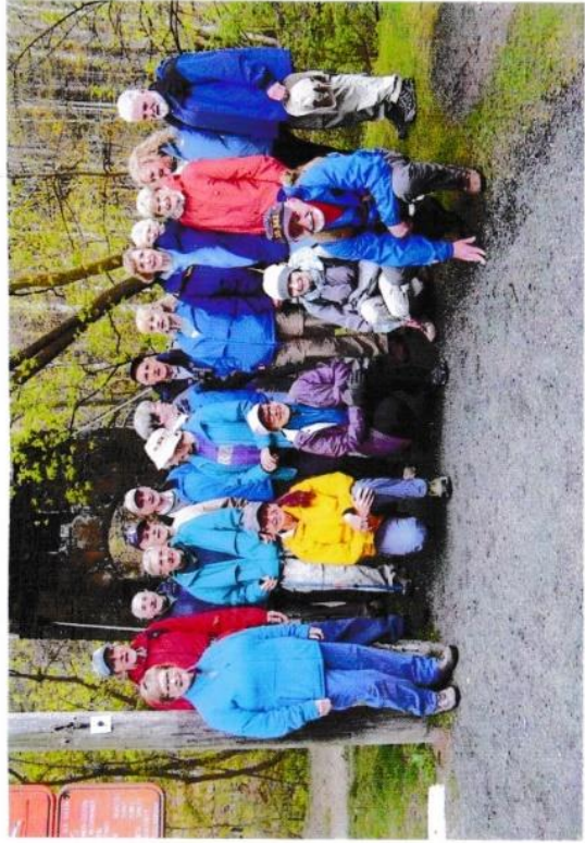
"LOST SOULS" IN MASSACHUSETTS 2016